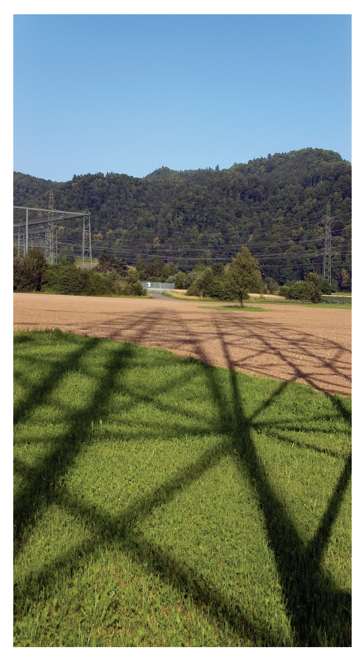
According to current research, power lines pose no significant public health threat to the population, a literature study by the Forschungsstiftung Strom and Mobilkommunikation shows.

When the toaster is plugged in, there is an electrical voltage in the appliance and as a result, an electric field. If the toaster is turned on, an electric current flows and this then generates a magnetic field. Electromagnetic fields are an indispensable part of our modern everyday life: they make it possible to wirelessly transmit electrical energy in inductive charging stations; or they transfer information—for instance a telephone conversation from the mobile phone to the nearest base station antenna, a radio program from the Uetliberg Antenna to