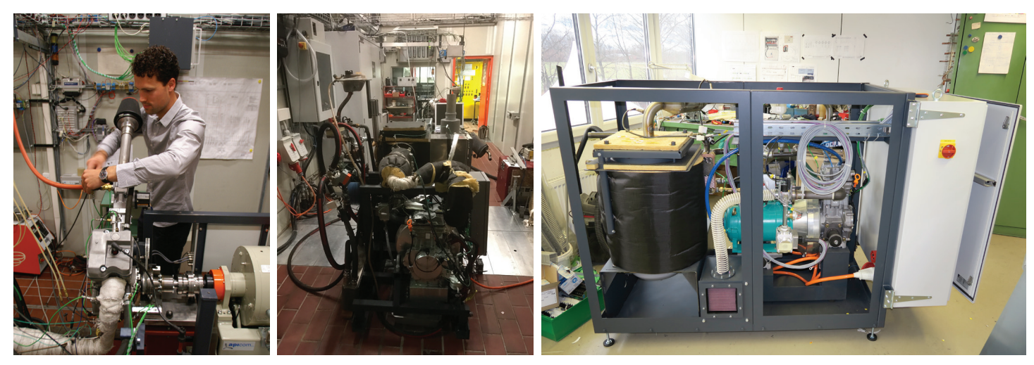
Step by step towards a Micro-CHP: In the project ALADIN I (2011 to 2014), researchers from the ETH Zurich studied the technical foundations of a Micro-CHP (picture left with the former ETH doctoral student Philipp Vögelin). During the project ALADIN II (2015 to 2017), they developed a Micro-CHP on the basis of the acquired laboratory knowledge (middle picture). This resulted in a functional model (picture on the right), which is now being tested and optimized by Hoval Aktiengesellschaft (Vaduz), Bucher AG Langenthal and sa-charging solutions AG (Mellingen / AG). The metal frame shows the size of the functional model, the control box is attached on the right.

Decentralized power plants that produce electricity and heat at the same time are in trend. This is achieved, for example, by connecting photovoltaic modules to a heat pump. Also popular are natural gas, biogas, wood or oil-fueled combined heat and power plants. These are typically used in Switzerland to supply industrial enterprises and entire neighborhoods. They achieve a total efficiency of 88 to 95%; up to 40% as electrical energy, the rest as heat. A recent development is Micro-CHP in the low power range (5 to 15 kW<sub>el</sub>) for application in single and multi-family houses as well as in commercial enterprises. Several of these systems are already on the market.