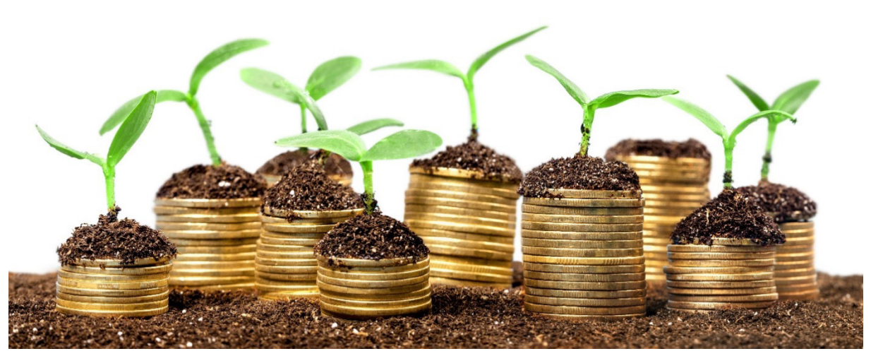
Version 2: September 2023