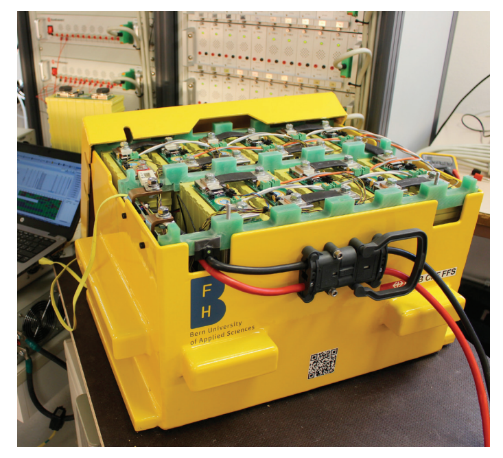
The prototype model developed at the BFH-CSEM Energy Storage Research Centre in Biel consists of eleven lithium-ion battery cells and has a storage capacity of 6.5 kWh.

The type of battery described above would sporadically supply power to wagons and to a relatively small extent, in everyday SBB operation. This can be exemplified in a low-floor FLIRT multiple unit train (RABe523xxx), as is used in re-